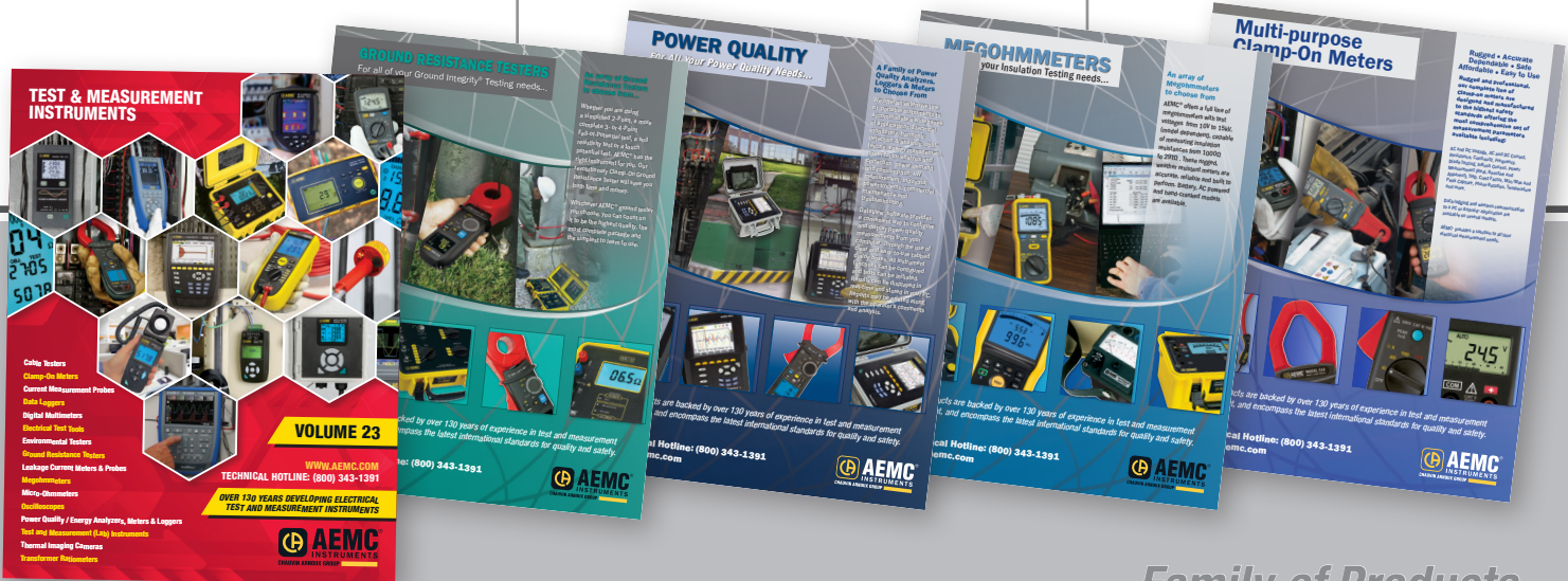
Family of Products

12-16 Rue Sarah Bernhardt 92600 Asnières-Sur-Seine, FR Tel +1 33 1 44 85 45 85 Fax +1 33 1 46 27 73 89 info@chauvin-arnoux.com www.chauvin-arnoux.com