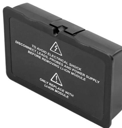
Battery Pack – Cat. #2960.47