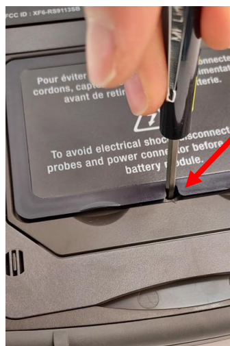
Battery Release Recess