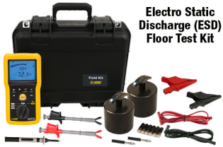
Electro Static Discharge (ESD) Floor Test Kit