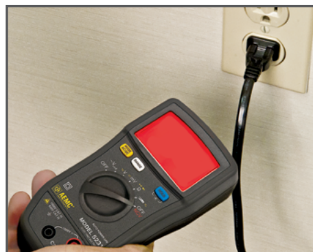
Non-contact detection of network voltage (NCV Function-AC only)